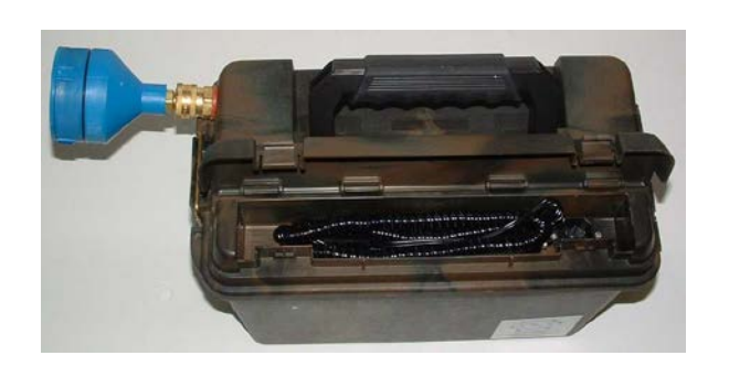
Air Sampler on window bracket