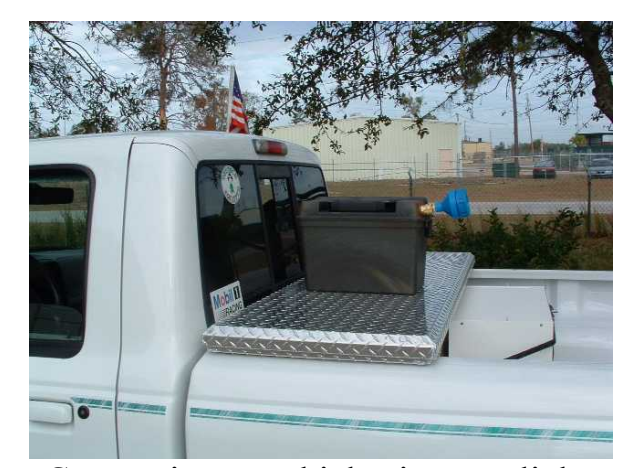
Connection to vehicle cigarette lighter for 12VDCor sampling applications

Cigarette Lighter Cord stores in Compartment accessible from outside.