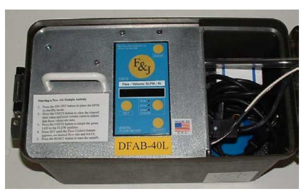
View of Inside