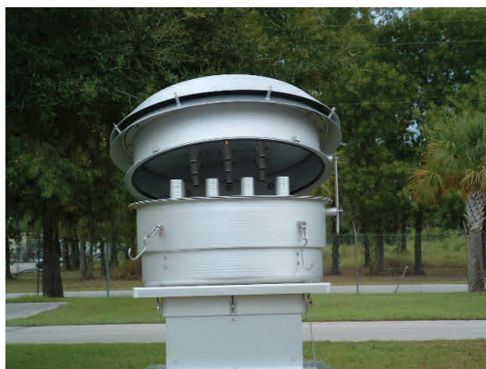
View of PM2.5 Size Selective Inlet illustrating interior features