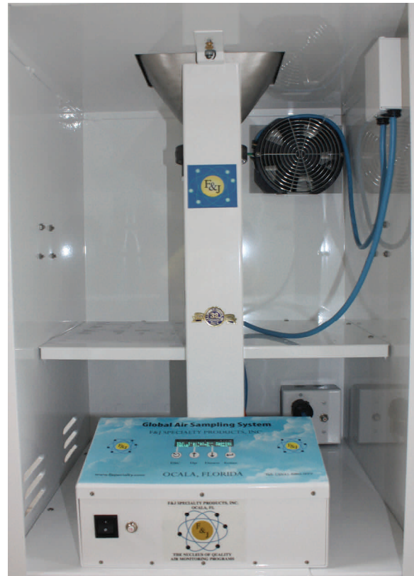
Close up of Global Air Sampler Electronic Module