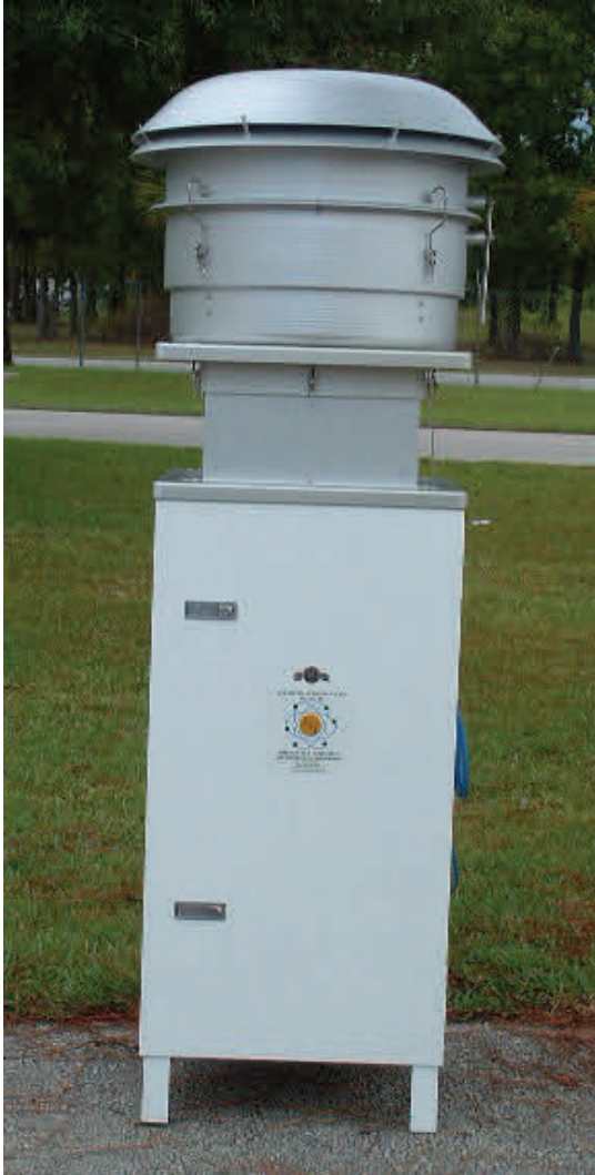
GAS-PM2.5DE Series System Normal Operating Scenario