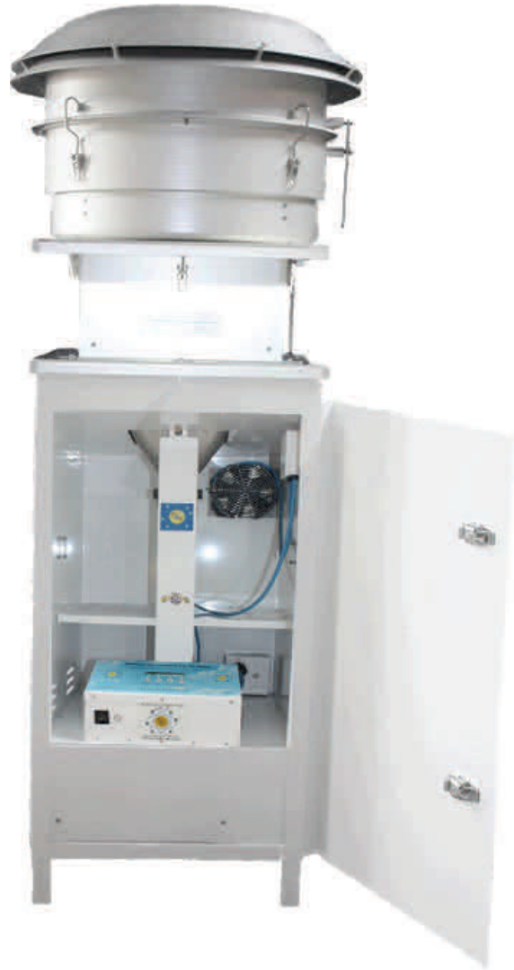
GAS-PM2.5DE Series System Enclosure Door Open