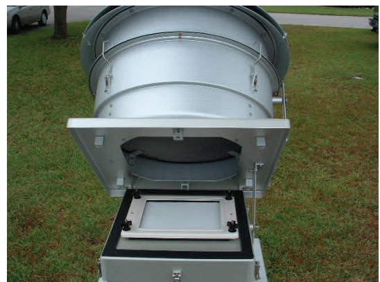
GAS-PM2.5DE Series System PM2.5 Inlet Open Position for Access to Filter Paper